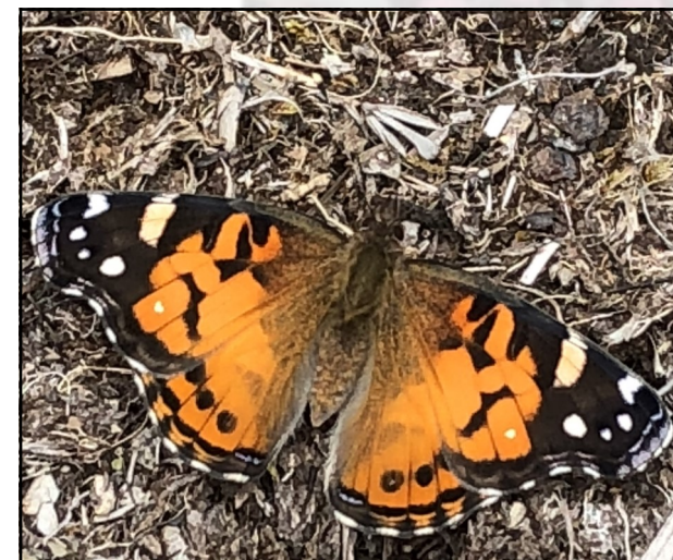
Wildlife habitat creation for a targeted native wildlife species such as the Kamehameha butterfly (pulelehua).