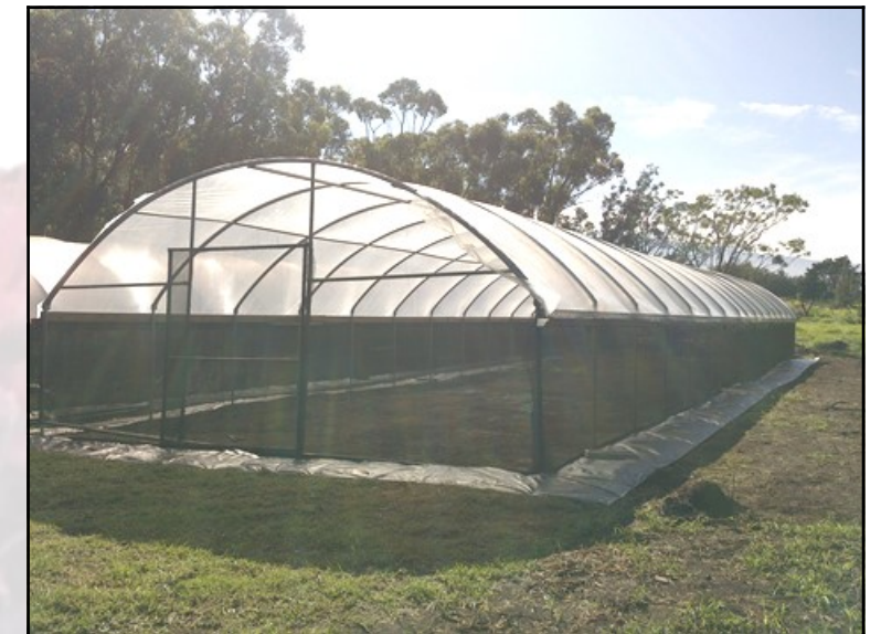
High tunnels are used to increase crop productivity and health.

A conservation plan evaluates the impacts of agricultural activities on the available natural resources on the land. The goal is to reduce or eliminate soil erosion while protecting streams and coastlines from excessive sedimentation. Examples of resource concerns that can be addressed in a conservation plan includes: soil erosion, invasive species, livestock production, restoration of native forest and wildlife habitat, plant productivity, water sedimentation, and nutrient management.