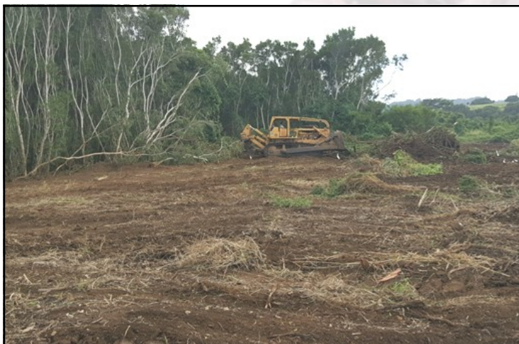
Vegetation clearing, which is an example of grubbing, requires a G&G permit.