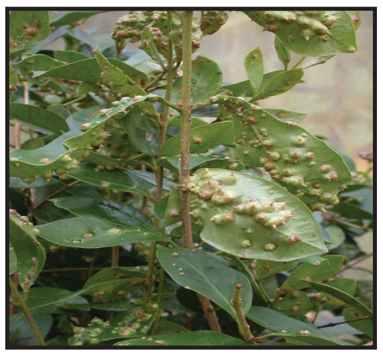
Galls formed by Tectoccus ovatus

fruit crops, by providing an alternate host for the Mediterranean fruit fly. Dense root masses can absorb, block or alter the natural flow of rain from entering fresh water aquafers. It is estimated that there is at least 300,000 acres of strawberry guava on Hawaii Island alone. In Hawaii, strawberry guava is commonly controlled by cutting, bulldozing and/or application