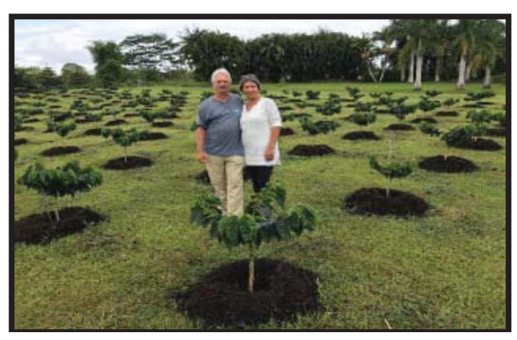
Second Year of Mulching (coffee plants look very healthy and vigorous)