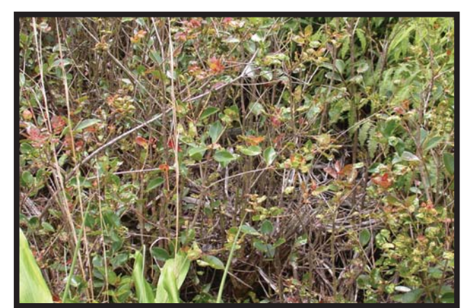
Plants after two years of observations: Note the defoliation of the plant canopy and regrowth of Uluhe Ferns being established in the understory. May 2017

The Brazilian scale, Tectococcus ovatus Hempel (Hemiptera: Eriococcideae) is a small scale insect that creates galls on young leaves. A single female remains enclosed in the gall throughout her life, producing a several hundred eggs in a matrix of wax filaments, which help the crawlers to float in the wind. Under laboratory conditions, Tectococcus reproduces continuously with a