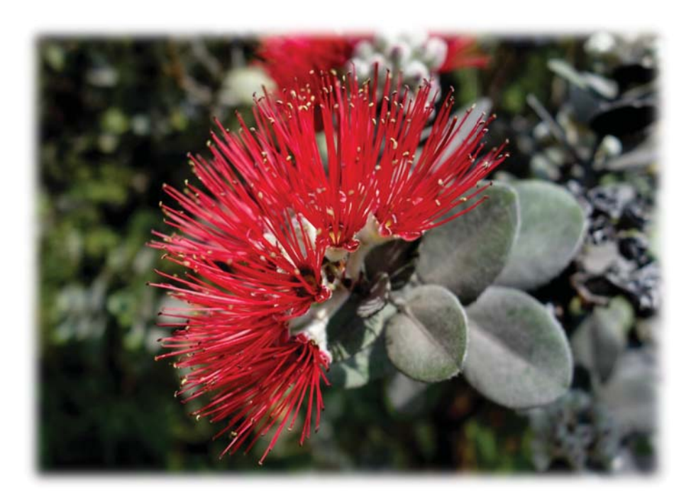
Kori Hisashima, District Conservationist

The Hilo Field Office (comprised of members of NRCS, Puna, Ka'u, Hamakua and Waiakea Soil and Water Conservation Districts) focused their 2016 fiscal year on working together to help people achieve their natural resource and business goals. Covering our 1.3 million acres of cropland, pastureland, rangeland and forestland we assisted over 80 cooperators. Site visits were completed for each request and the necessary assistance provided to meet their needs which comprised of: soil erosion, noxious and invasive weeds and animals, forest stand health, pasture health and economic impacts on agricultural production.