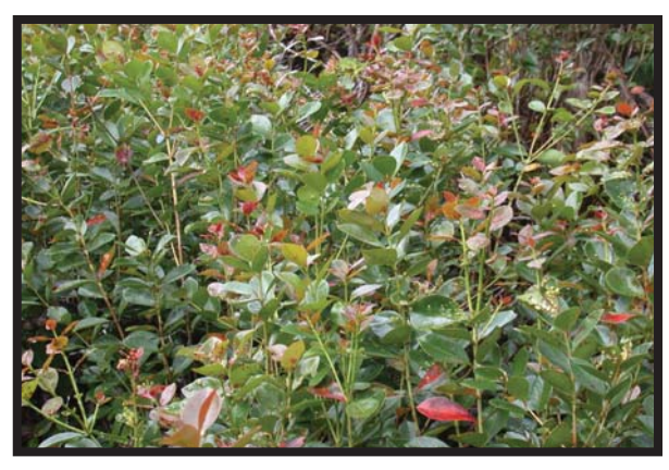
Strawberry Guava Plants before being inoculated: Note the monotypic stand of Strawberry Guava December 2015

The US Forest service conducted host test studies with dozens of native, non-native plants related to strawberry guava. In Hawaii, the family Myrtaceae is represented by 49 species in 9 genera, including 8 native species. All laboratory test and field observations indicate that Tectococcus is highly host specific to strawberry guava. In November 2011, the Hawaii Department of Agriculture, USDA Animal and Plant Health Inspection service, US Fish and Wildlife services, State of Hawaii Board of agriculture and the public reviewed the final environmental assessment (EA) and decided that Tectococcus could be utilized as a biological control for strawberry guava.