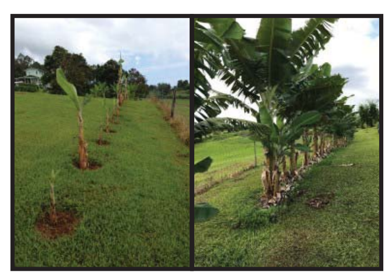
Windbreak Establishment with Apple Banana (photo on left was established in 2016, photo on right was a years growth)